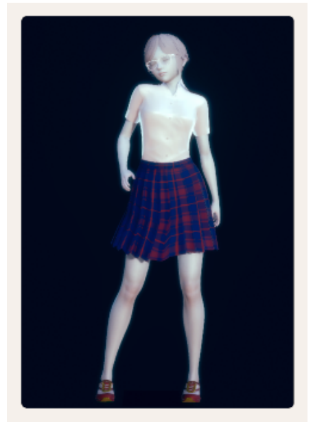
Level 1 - without Overall